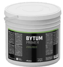
BYTUM PRIMER page 53