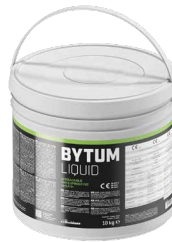
BYTUM LIQUID page 50