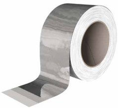
ALU BAND page 66